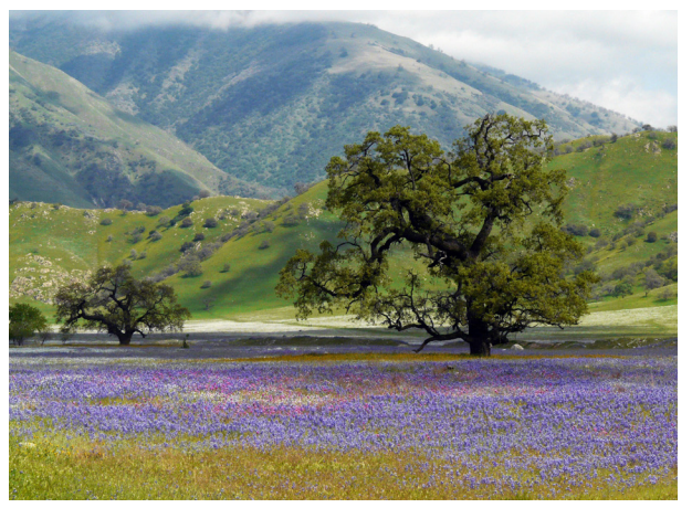
Tejon Ranch Oaks.

California is a globally significant biodiversity hotspot. With roughly 6,500 native plant taxa, the Golden State boasts similar botanical diversity to Japan and New Zealand. It's mild climates and rugged landscapes have also made California a highly desirable place to live, with a population close to 40 million people and growing. Demands for housing, resources, and a changing climate are placing increasing pressure on California's unique flora. Region-wide planning efforts are being developed to meet the demands of an increasing population.