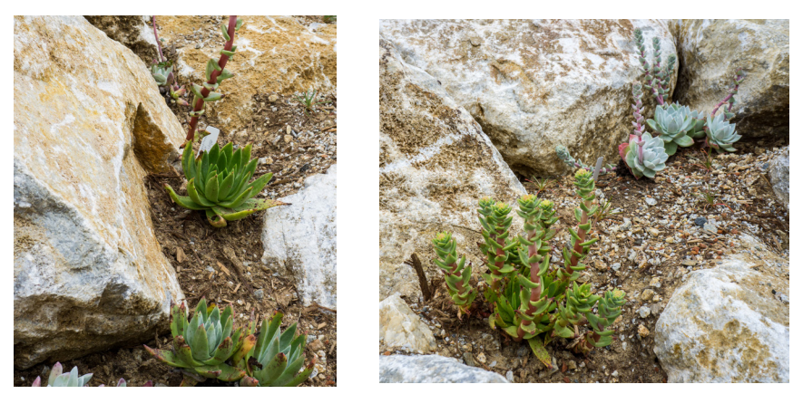
Newly planted dudleya in UCSC Arboretum rock garden.