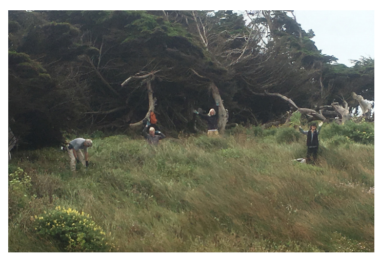
Part of the habitat restoration team at Baldwin Bluffs restoration site.