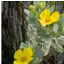
California Native Garden