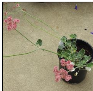
Eriogonum grande var rubescens (Rosy Buckwheat)

New plants (quantities limited) recently delivered from the Arboretum's nursery include a low-growing California native with masses of summer pink flowers and a medium size shrub with magenta blooms and lemon scented leaves.