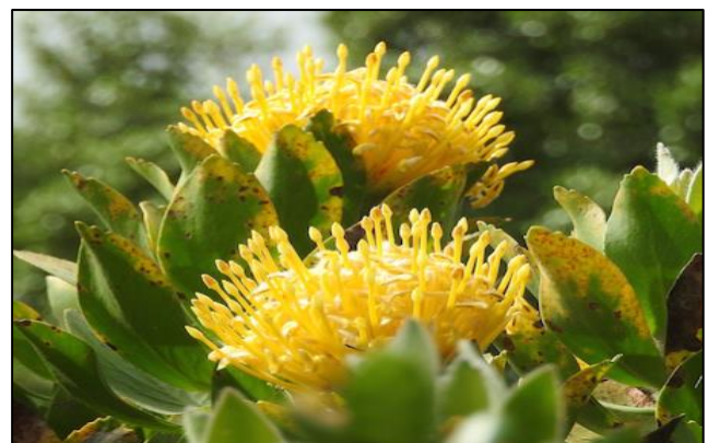
Leucospermum glabrum x conocarpodendron