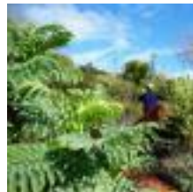
Aroma / Succulent Gardens