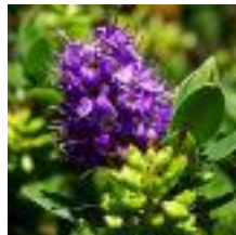
New Zealand Garden