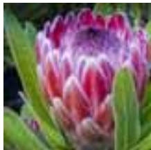
South African Garden