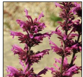
Agastache Mexicana 'Sangria' (Mexican Giant Hyssop)

At Norrie's, you can pay admission and pick up a Visitor Guide and Map. Volunteers will point out locations of spectacular blooms and artwork as well as where hummingbirds have been recently spotted.