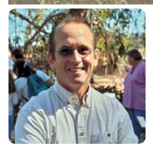
Dear Arboretum Friends,

"Happiness lies not in the mere possession of money; it lies in the joy of achievement, in the thrill of creative effort.