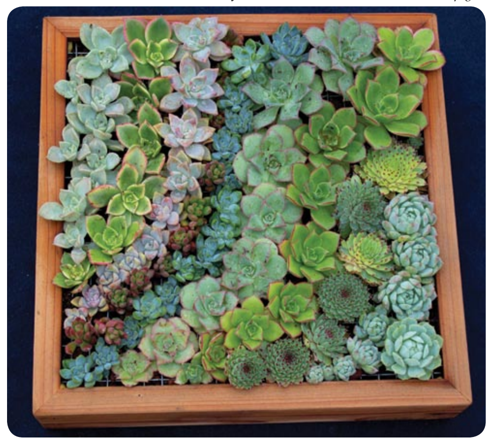
Succulent picture frames can be hung up or placed flat on a table.