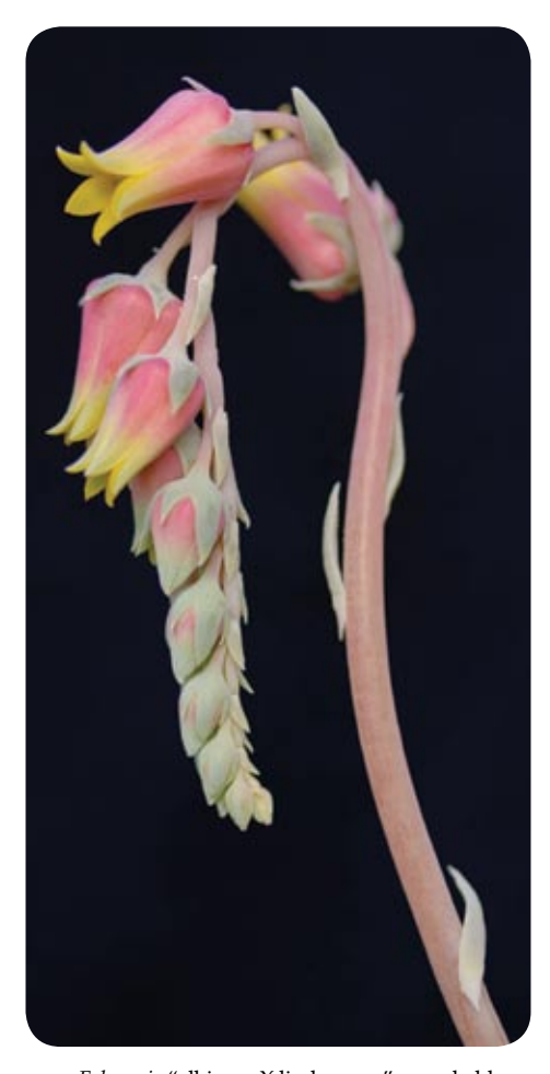
Echeveria "albicans X lindsayana", a probable Grim hybrid awaits a name change.