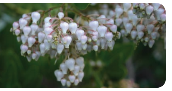
Island Manzanita. Arctostaphylos insalaris 'Ward'

Buy the book for $25 at Norrie's Gift Shop, while you are doing your holiday shopping. Thanks to the generosity of the author, for any of the books sold at the Arboretum, all $25 will go directly to the Arboretum.