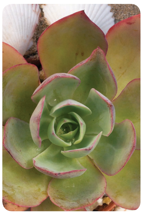
Hyper tufa pot with Echeveria

Jointly sponsored event by the Baroque Festival and the Arboretum. Music in four or five places in the Arboretum gardens.