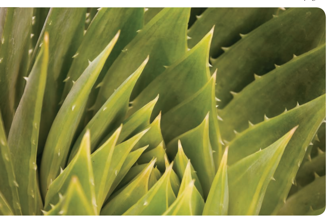
Aloe polyphylla, 'the spiral aloe'