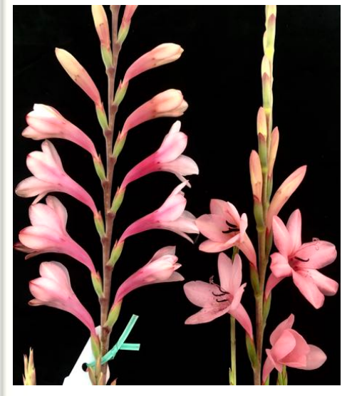
Flower traits: shaded vs uniform coloring

Though Grantham definitely prefers flowers that face up or forward, his primary focus is producing diversity—the more flower shades and shapes and the more foliage forms and sizes, the better! Currently he is enthused about unexpected flower colors of some of his recent hybrids: a new deep purple, a unique shade of lavender, and a subtle bi-color. He is especially interested in cross-pollinating a Watsonia hysterantha that is producing red blooms on a stem completely devoid of leaves to see what new variations might occur.