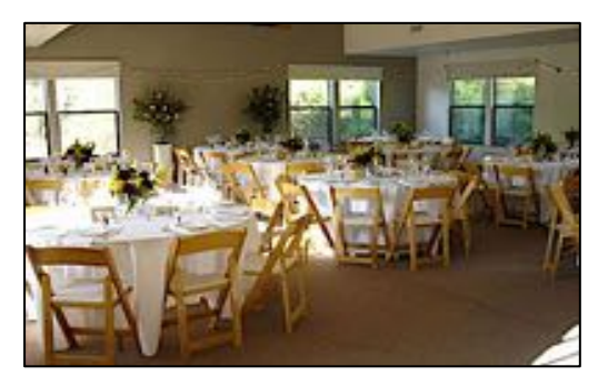
The Horticulture II Meeting Hall is idea for indoor events; it comfortably holds 125 people for lectures and 85 people in a classroom or sit-down meal format.